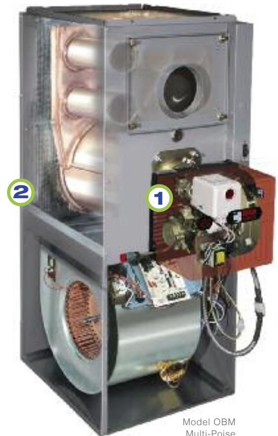
Model OBM Multi-Poise (Riello Burner)